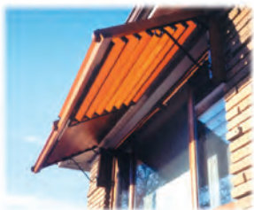
Easy Open / Close Awnings