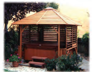
Hot Tub & Spa Enclosures