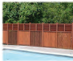
Dramatic Fences & Railings