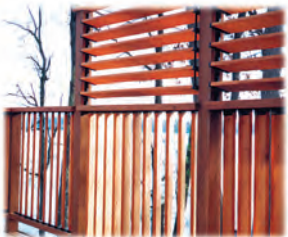
Wind & Privacy Panels

One simple hardware kit offers endless design & functional solutions!